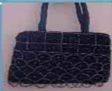
Code:P001, Rs 150