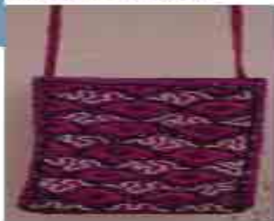
Code: P003, Rs 150