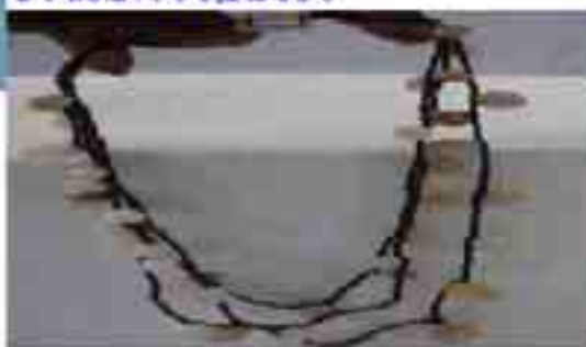
Code:N003, Rs 150