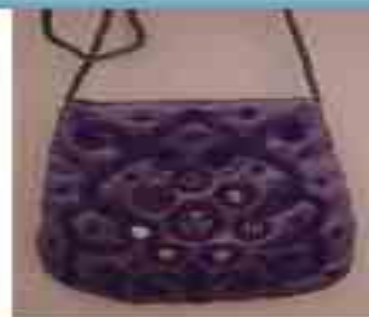
Code:P002, Rs 150