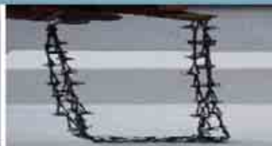
Code:N002, Rs 150