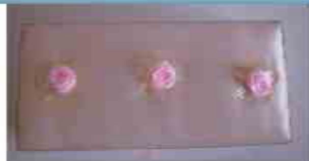
Code :J002,Rs 150