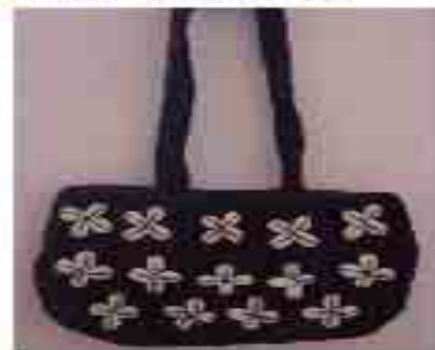
Code P003, Rs 150