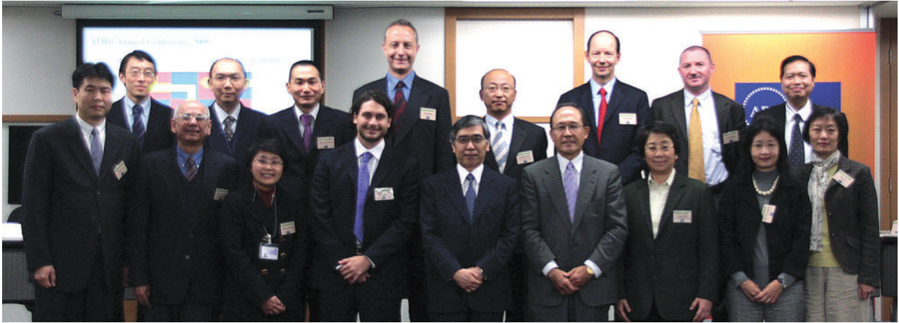
ADB President Kuroda and ADBI Dean Kawai with the speakers and discussants at ADBI's 2009 Annual Conference.

Find more details about this event at www.adbi.org/event/3357.adbi.annual.conference.2009/ .