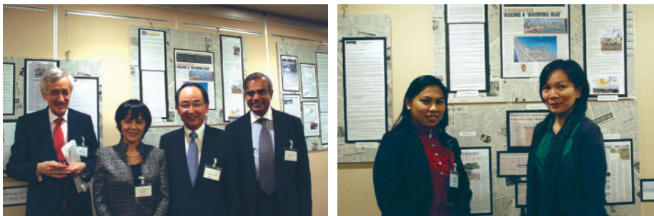
The Developing Asia Journalism Awards gave participants and attendees something to write home about.