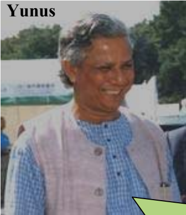
Dr. Muhammad Yunus